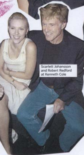
Scarlett Johansson and Robert Redford at Kenneth Cole