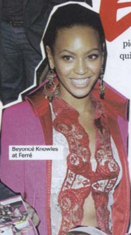
Beyoncé Knowles at Ferré