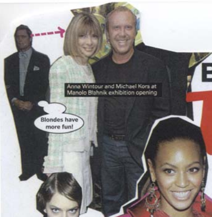
Anna Wintour and Michael Kors at Manolo Blahnik exhibition opening