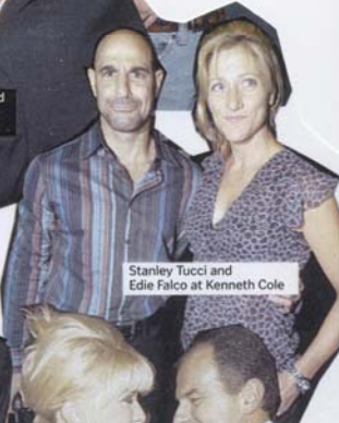
Stanley Tucci and Edie Falco at Kenneth Cole