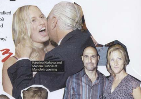
Karolina Kurkova and Manolo Blahnik at Manolo's opening