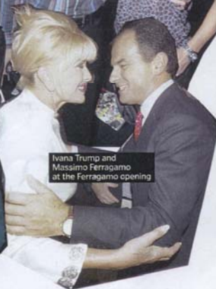
Ivana Trump and Massimo Ferragamo at the Ferragamo opening