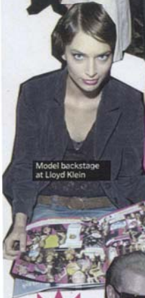
Model backstage at Lloyd Klein