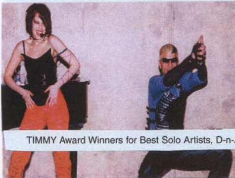
TIMMY Award Winners for Best Solo Artists, D-n-A